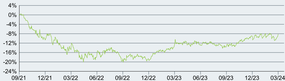
Premium-discount graph illustrates the amount by which the market price trades above or below net asset value.