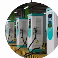
Pan-European charging network by Ionity