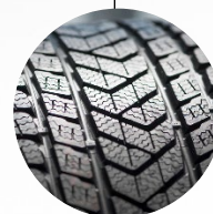
Low-emission carbon-black rubber tires by Monolith