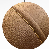
Mycelium leather upholstery by MycoWorks