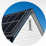
Charging at home by solarZero