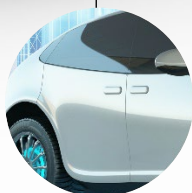
Recycled plastic body by E360S